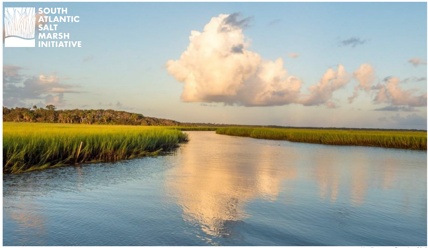
Between land and sea lie ecological guardians of the coast—salt marshes.