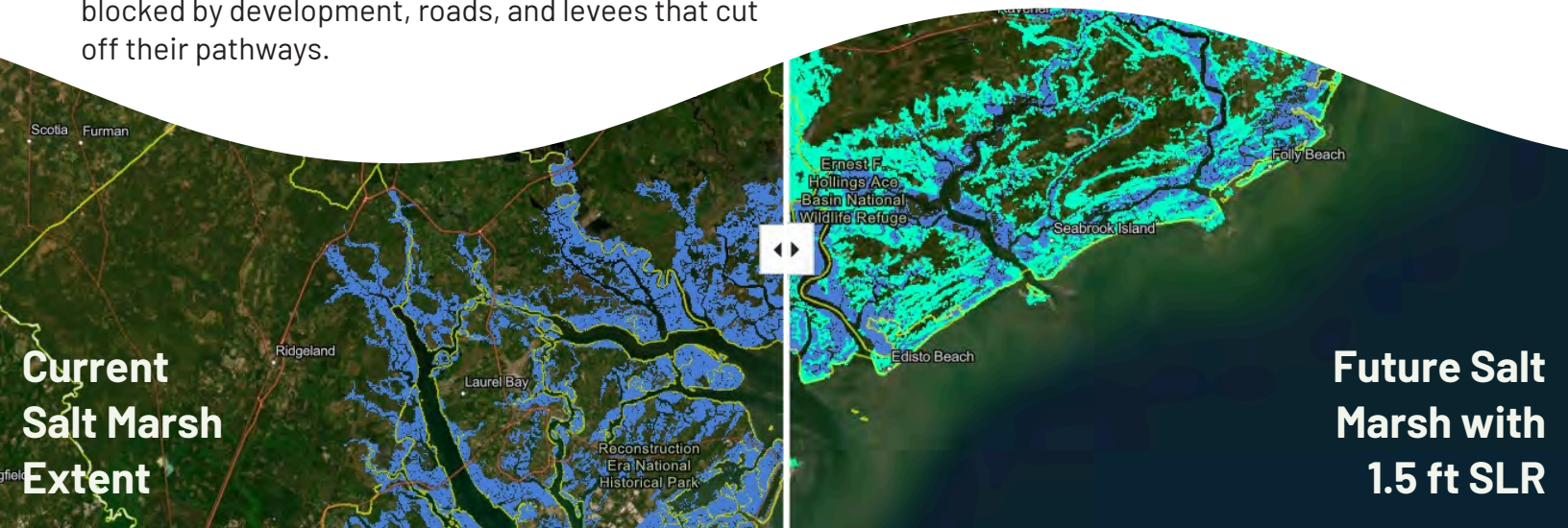
Current Salt Marsh Extent

In a 1.5 foot sea-level rise scenario in South Carolina, it is expected that 257,937 acres will be converted into salt marsh habitat. Future planning for this migration event will hinge on comprehensive plans of counties and local governments, land protection efforts, and the removal of barriers to allow for salt marsh migration.